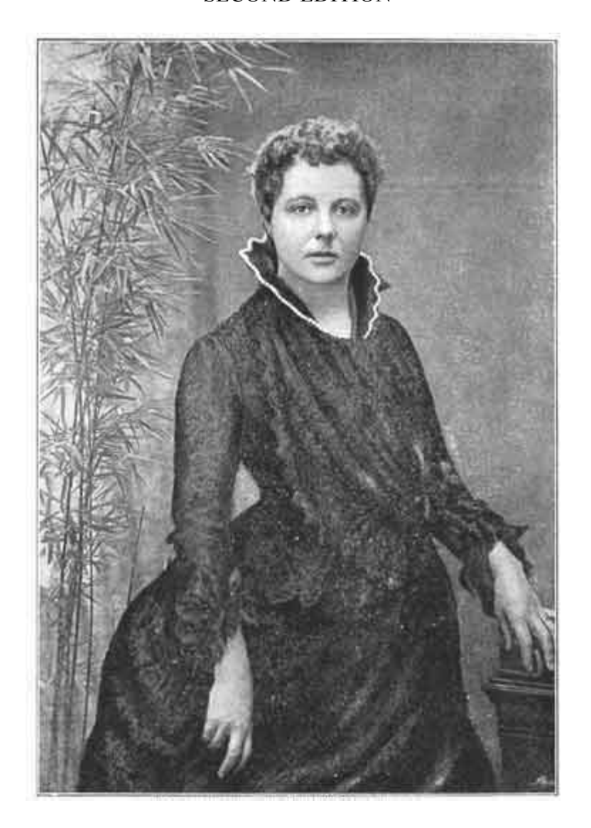
Annie Besant 1885